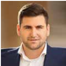
MEP Andrey Novakov