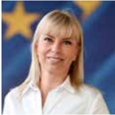
Commissioner Elżbieta Bieńkowska Responsible for Internal Market, Industry, Entrepreneurship and SMEs

I want to see the programme grow in importance, with more and more successful entrepreneurs, creating more and more start-ups and SMEs that grow and scale-up within Europe and create the leaders of tomorrow.