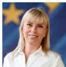
Commissioner Elżbieta Bieńkowska

Onwards to the next ten successful years!